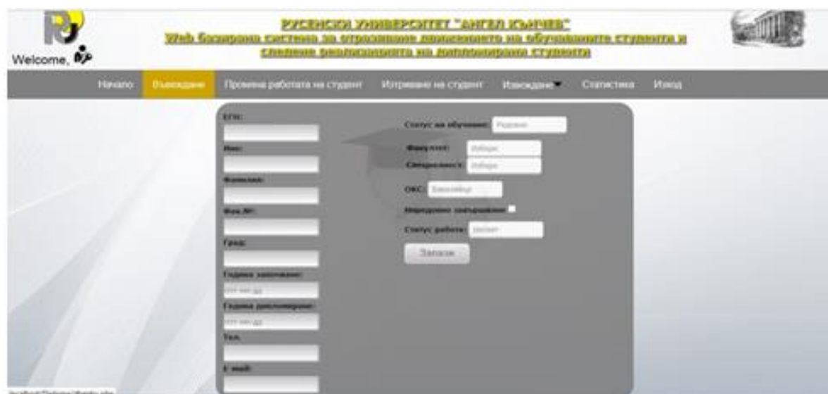
Fig. 1. Main window for entering the information for a trainee student

Fig. 1 shows the main data entry window for a learner.