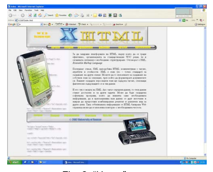
Fig. 2. "Home" page