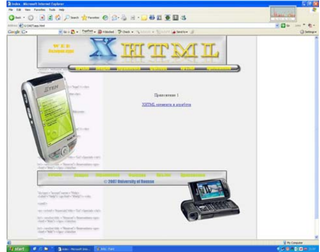
Fig. 6. "Links" page