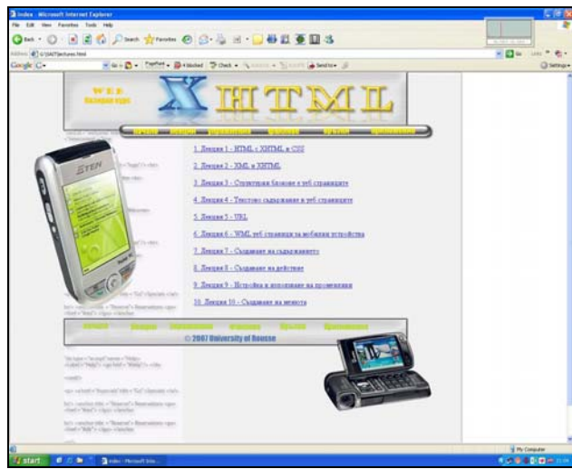
Fig. 3. "Lectures" page