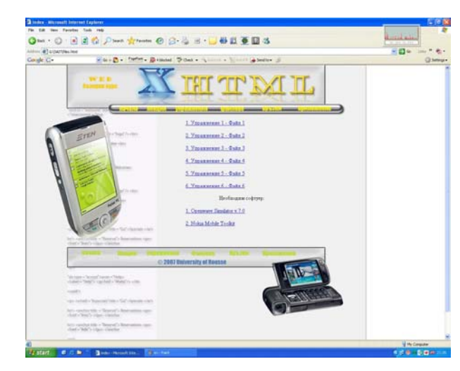
Fig. 4. "Exercises" page